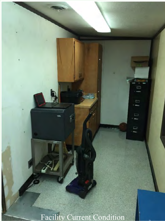
Facility Current Condition

Each year class participants select, organize, and raise funds to implement a project beneficial to the Douglas County community. This year, the chamber's Project Leadership class is collaborating with Fremont Middle School to improve and renovate the Turnaround Program Classroom.