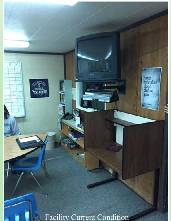
Facility Current Condition

The Turnaround Program (TAP) at Fremont Middle School serves students who struggle in school because of emotional disturbance or behavior problems caused by health impairments or other factors beyond their control. The main purpose of TAP is to help students learn appropriate skills and techniques to manage stress and behavior, so they will become better self-managers and eventually exit the program to be self-sufficient in mainstream education.