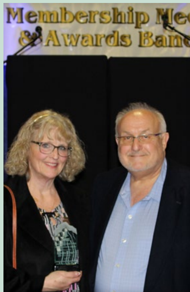
Riverview Terrace 2019 Medium Business of the Year