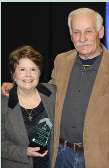
Wintergreen Nursery, Landscape & Florist 2019 Small Business of the Year