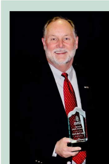
Rogue Credit Union 2019 Business Innovator of the Year