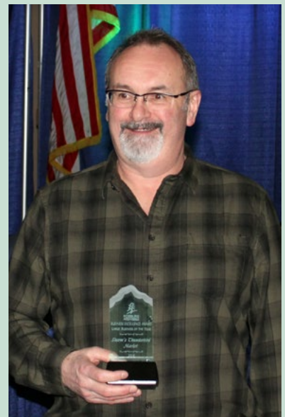
Sherm's Thunderbird Market Roseburg 2019 Large Business of the Year